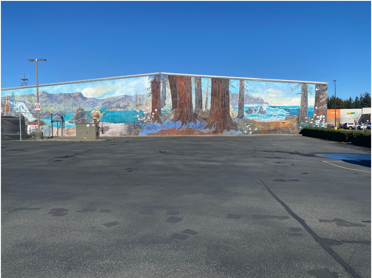
April 2. Northern California and Southern Oregon Campsites