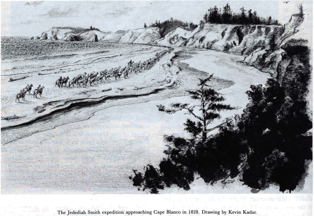
The Jedediah Smith expedition approaching Cape Blanco in 1828. Drawing by Kevin Kadar.