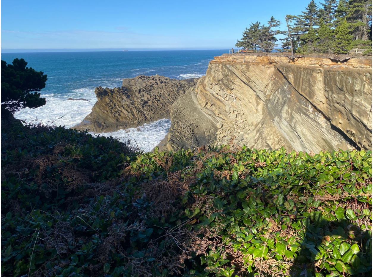
Shore Acres Trail, February 8, 2023, where Smith Expedition Camped July 3, 1828