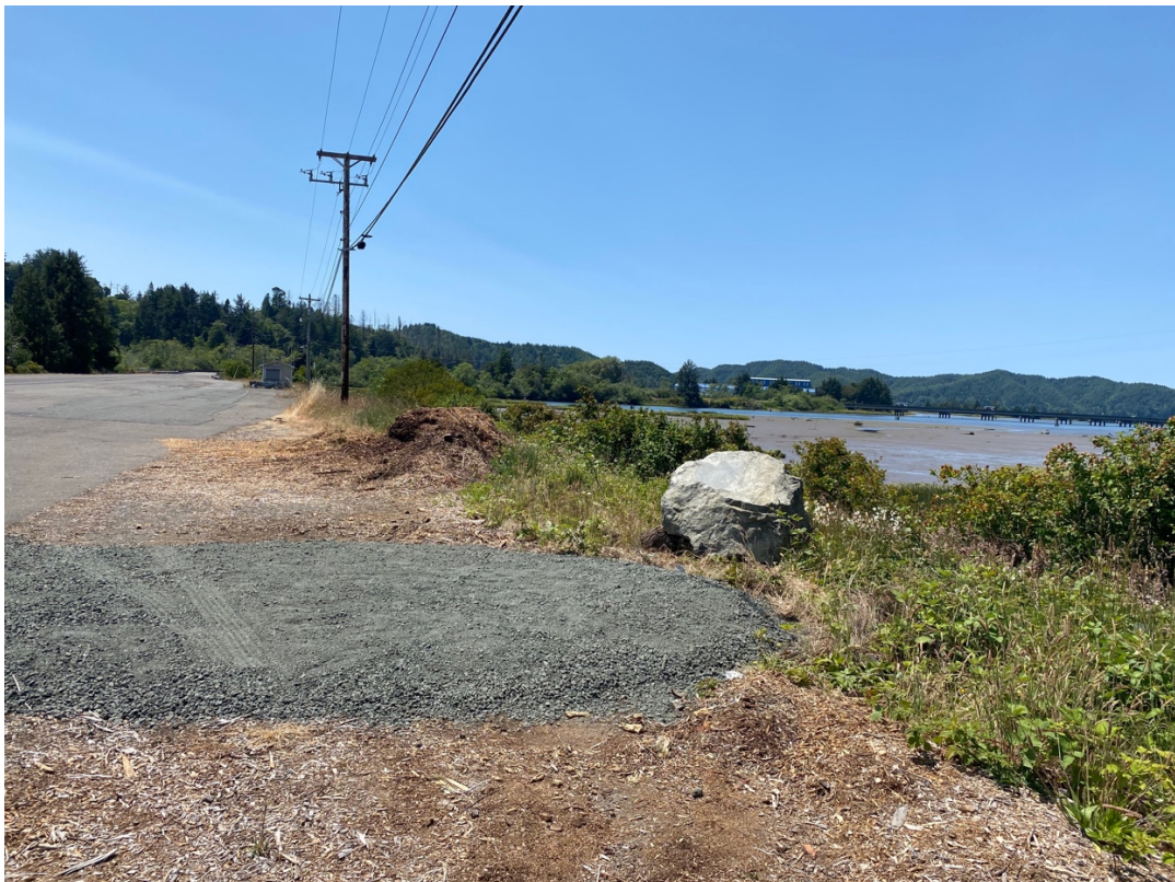
Gravel base and Umpqua Memorial stone at mouth of Smith River, Oregon, June 21, 2023.