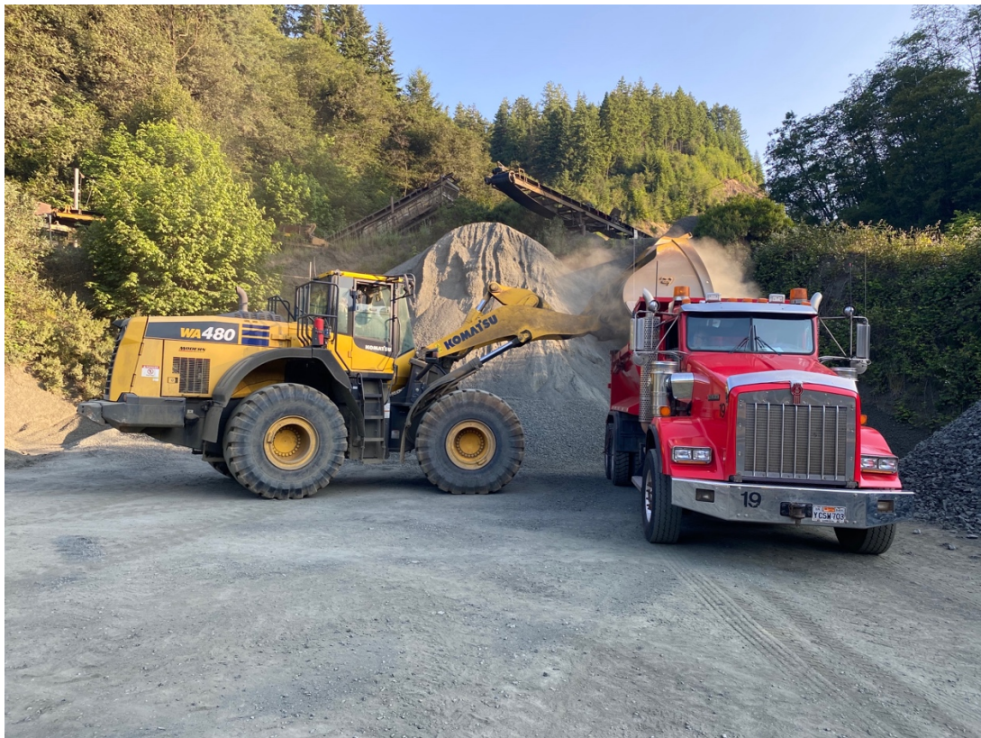
Main Rock's Komatsu WA480 loader putting bedding gravel onto Coos Bay Timber Operators dump truck for hauling with Memorial stone to Umpqua burial site.