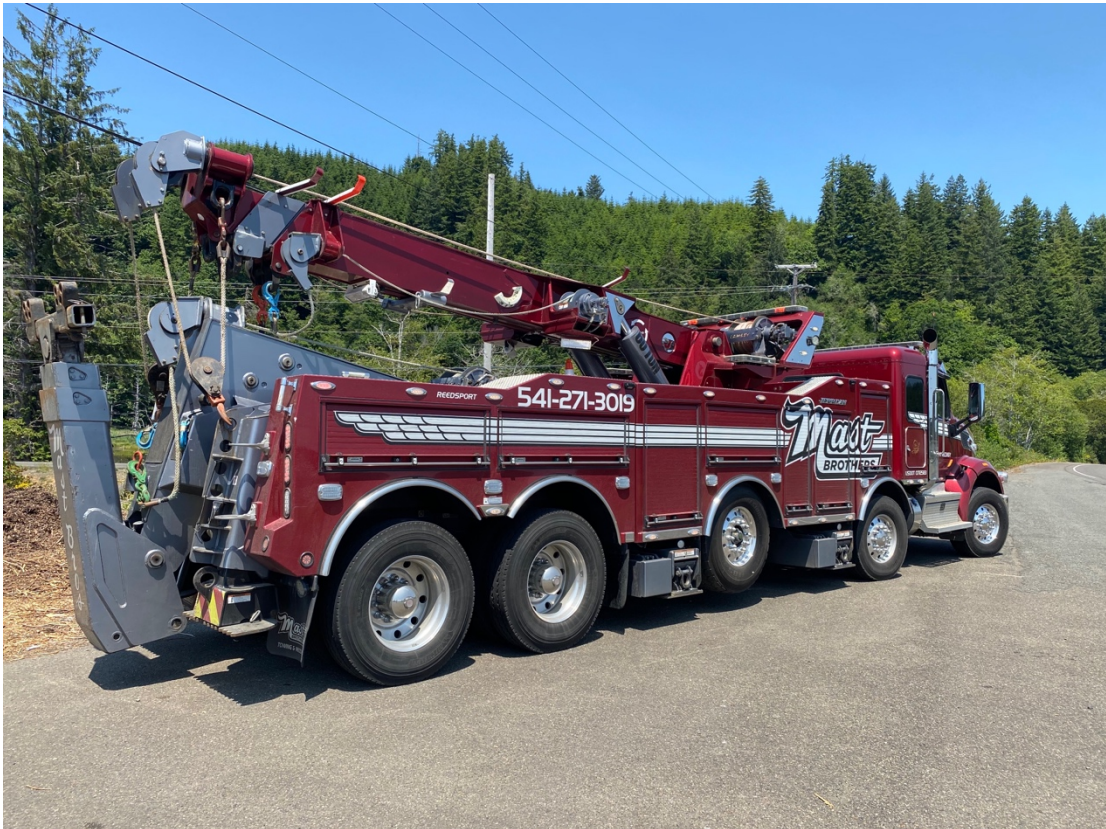
Mast Brothers donated the use of their Peterbilt heavy-duty rotator tow truck to lift and place the Umpqua Memorial stone into its permanent location at mouth of Smith River, Oregon, June 21, 2023.