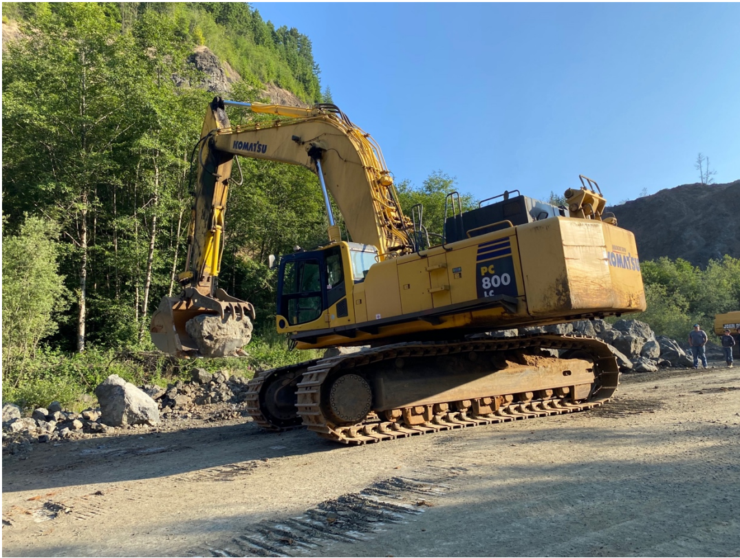
Main Rock's Komatsu PC800 excavator lifting Umpqua Memorial stone.