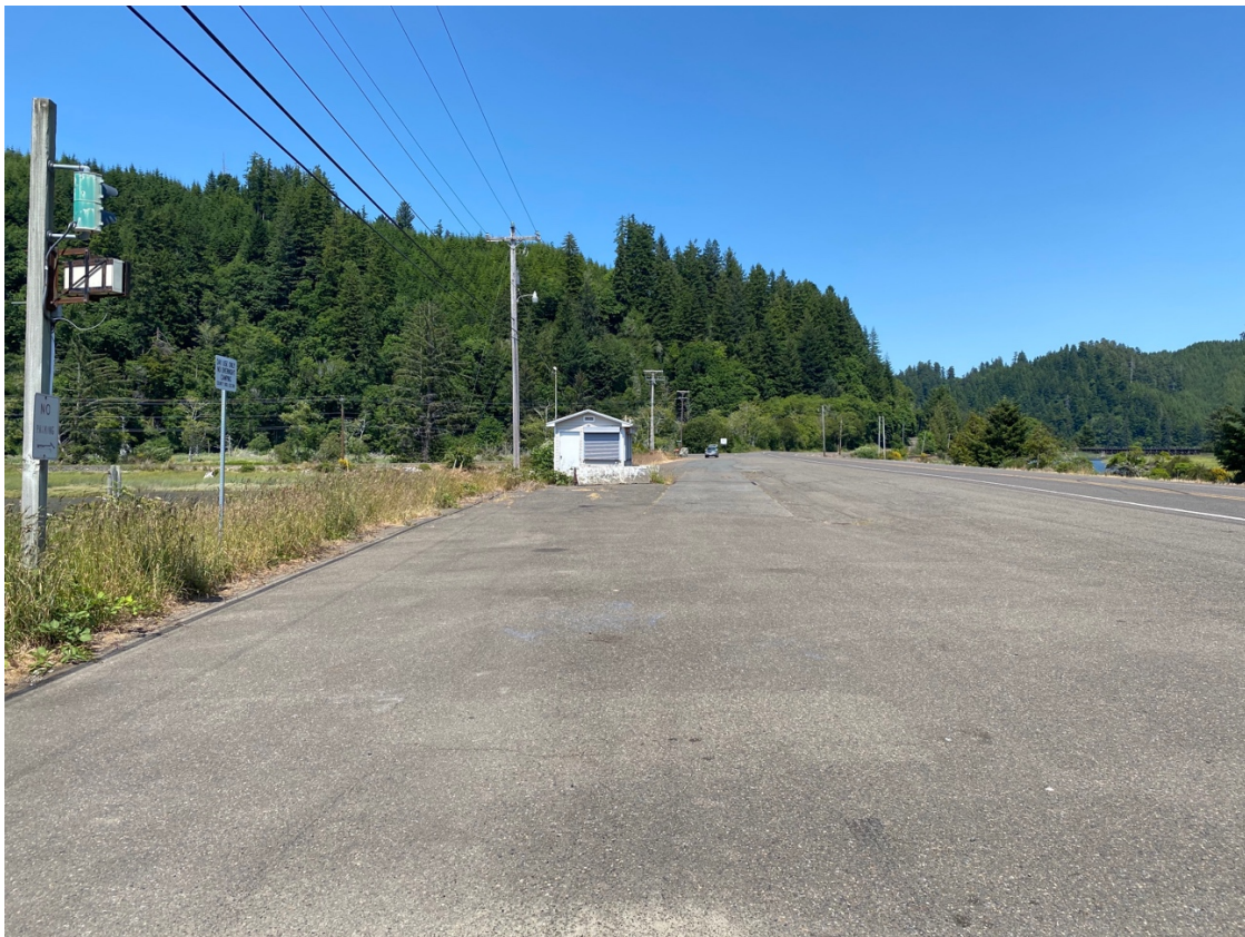
Long-distance view of weigh station turnout, David Gould, the Umpqua Memorial stone, and David's vehicle for scale, looking north from Lower Smith River Road, Oregon, June 21, 2023.