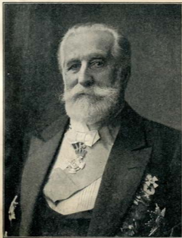
THE LATE PROF. ERNST VON BERGMANN.

Full descriptive literature upon application.