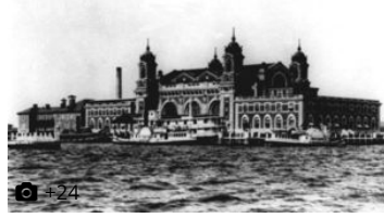
Through the years: Immigration in America in 25 photos