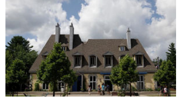
Summer's a great time to dive into a foreign language

Today's top pics: Protests continue against Fillon and more