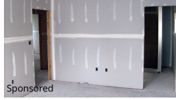
Don't hang your own drywall