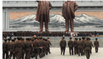
Diary from inside North Korea