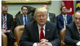
Trump: Leakers will 'pay a big price'