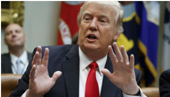
Intelligence officials may be keeping sensitive info from Donald Trump