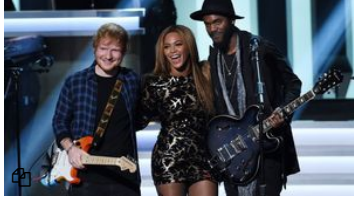
Predicting this year's Grammy Award winners