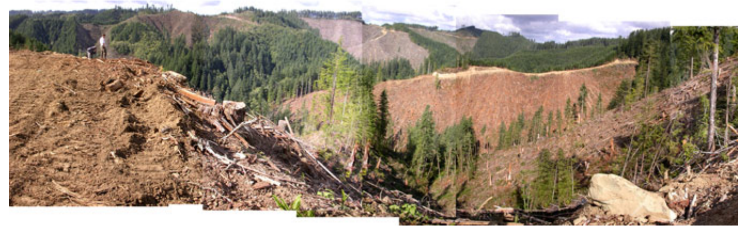
Composite overview picture of Elliott State Forest management techniques (photo taken 10/24/02)

Though the Elliott forest is entirely open for public enjoyment, it is managed almost exclusively for timber production. The Oregon State Constitution directs that the profits from revenues help support Oregon schools, because the Elliott is mostly "Common School Fund" land. The Oregon constitution directs that timber sale revenue goes into this school fund, "within the context of environmentally sound management." Or, perhaps the revenue is for Roseburg Forest Products, which buys most of the Elliott's sales -- 43.5 mmbf over the last 2.5 years, about 60% of the volume.