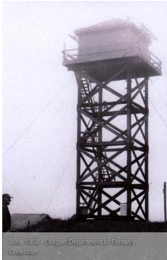
June 1959