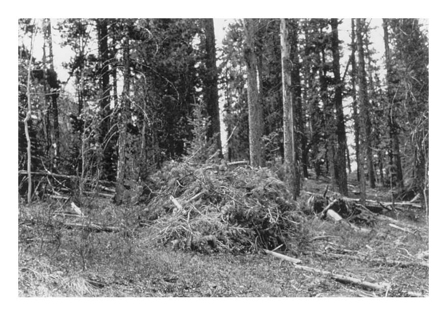
Fig. 3. Fuelbreak construction along the eastern boundary of Rocky Mountain National Park, Colorado. The treatment involved thinning of the original stand, with stem removal and hand piling prior to burning.

In the drier forest zones of the West, including much of the mixed-conifer forest with Douglas-fir and