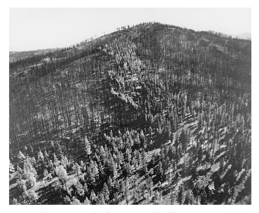
Fig. 4. Fire behavior was changed from crown to surface fire as a severe wildland fire passed through this fuelbreak on the Wenatchee National Forest, Washington. The fire then re-emerged as a crown fire on the far side. Area treatment of fuels beyond this narrow fuelbreak would have altered fire behavior over a wider area.

ponderosa pine, as well as much of the pure ponderosa pine type, historical fires were primarily of low severity. Substantial changes have occurred in these forests with the exclusion of fire, as well as from harvest activity (Biswell et al., 1973; Agee, 1993). A landscape-level approach to fuels looks at the large areas as a whole (Weatherspoon and Skinner, 1996), in an attempt to fragment the existing continuous, heavy fuel in high risk areas. Fuelbreaks may be a part of that strategy but are not considered a stand-alone strategy. If utilized, the fuelbreak component of a broad fuel management strategy might best be viewed as a set of initial (perhaps 10-20 years), strategically located entries into the landscape - places from which to build out in treating other appropriate parts of the landscape - not as an end in itself. Fuelbreaks may provide a measure of protection against large fires (assuming suppression forces are present) while longer-term, area-wide treatments are being implemented. Compartmentalization of fires by fuelbreaks, which may or may not be laid out in a connected network, can help to reduce fire size but generally will