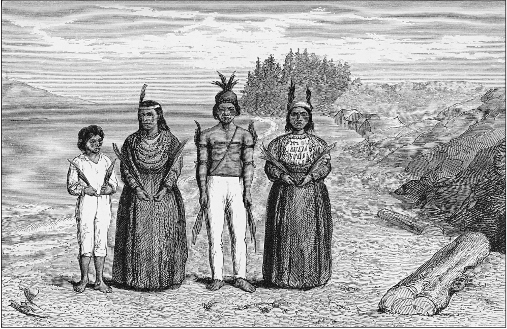
Alsea chief Kaseeah stands with two wives and his son at Yaquina Bay in 1877 (engraving based on a drawing by Wallis Nash, published in Nash, Oregon: There and Back again in 1877).

more losses through violent conflict, relocation, and immigration — the indigenous accounts resonate with the effects of United States settlement and reservation policy in western Oregon. They also reveal much about fur-company resource extraction practices and related violence that involved smaller, sedentary tribes or nations.