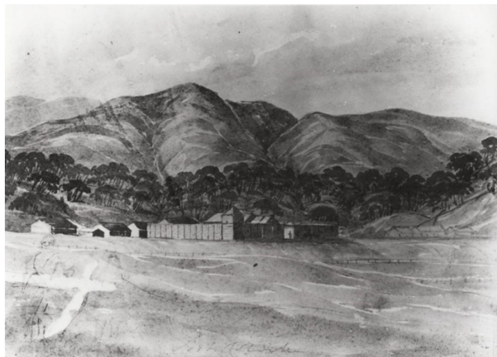
Artist rendition of Fort Colville looking southwest and overlooking the upper Columbia River, ca. 1845 (Courtesy National Park Service, Lake Roosevelt National Recreation Area)