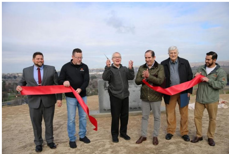
January 17, 2023

And so, Jed Smith’s extraordinary journey continues.