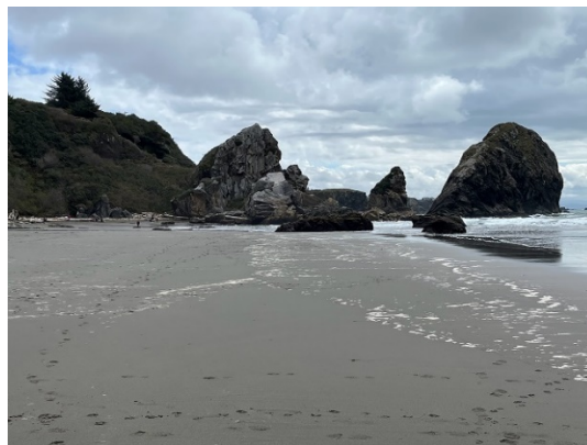
Harris Beach looking south.

Our first coastal stop in Oregon was Harris Beach State Park where we discussed the broken cliffs and stretches of sandy beaches that extend from northern California to Vancouver Island and still show the dramatic effects—and distinct travel barriers—that remain from the January 26, 1700, Cascadia earthquake and ensuing tsunami. This catastrophic event has been precisely dated using Japanese tsunami documentation and tree-ring analyses of submerged trees. Survivor accounts undoubtedly remained in the generational memory and stories of the native people Smith encountered. Smith's pack trail was the first along the southern Oregon Coast—memorable for its sheer cliffs and deep brush-filled ravines. Much of today's Highway 101 follows this route, but the oral histories are forever lost.