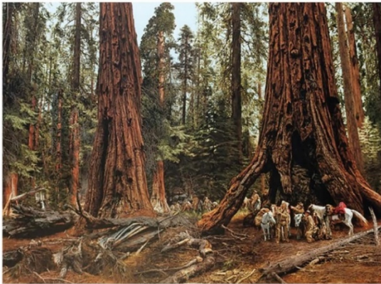
April 2 Guidebook (1): California Redwoods May 2 - June 22, 1828