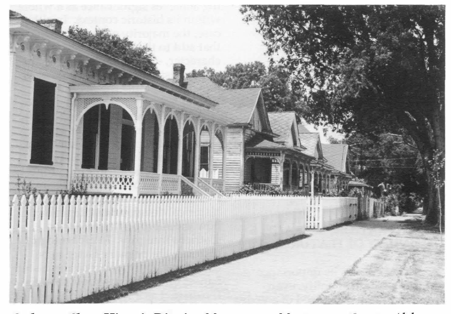
Ordeman-Shaw Historic District, Montgomery, Montgomery County, Alabama. Historic districts derive their identity from the interrationship of their resources. Part of the defining characteristics of this 19th century residential district in Montgomery, Alabama, is found in the rhythmic pattern of the rows of decorative porches. (Frank L. Thiermonge, III)

business districts canal systems groups of habitation sites college campuses estates and farms with large acreage/ numerous properties industrial complexes irrigation systems residential areas rural villages transportation networks rural historic districts