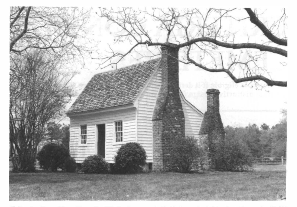
Criteria Consideration C - Birthplaces. A birthplace of a historical figure is eligible if the person is of outstanding importance and there is no other appropriate site or building associated with his or her productive life. The Walter Reed Birthplace , Gloucester vicinity, Gloucester County, Virginia is the most appropriate remaining building associated with the life of the man who, in 1900, discovered the cause and mode of transmission of the great scourge of the tropics, yellow fever. (Virginia Historic Landmarks Commission)

A birthplace or grave can also be eligible if it is significant for reasons other than association with the productive life of the person in question. It can be eligible for significance under Criterion A for association with important events, under Criterion B for association with the productive lives of other important persons, or under Criterion C for architectural significance. A birthplace or grave can also be eligible in rare cases if, after the passage of time, it is significant for its commemorative value. (See Criteria Consideration F for a discussion of commemorative properties.) A birthplace or grave can also be eligible under Criterion D if it contains important information on research, e.g., demography, pathology, mortuary practices, socioeconomic status differentiation.