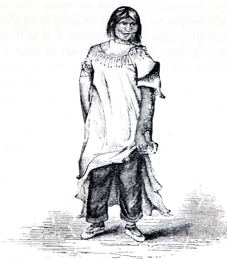
UMPQUA INDIAN GIRL.

The Etnemtane were known as “Upper Umpqua” during historical times, and occupied the Umpqua River upriver from the Kelawatsets, and the South Umpqua headwaters to the north of the Hanis Coos and Miluk Coos, and to the east of the Mishikhwutmetunne. They were well known to Hudson’s Bay Company beaver trappers, and often served as guides or hunters when opportunities presented themselves.