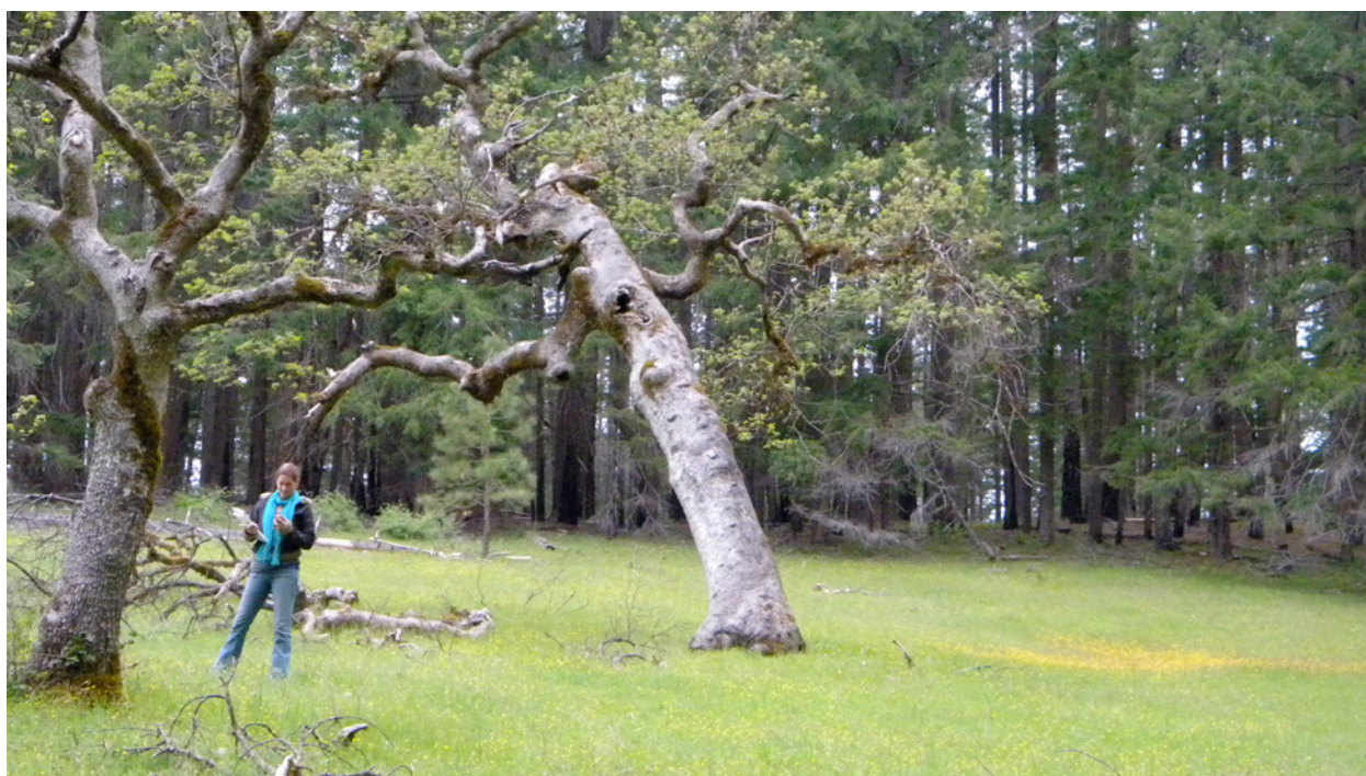
Figure 3.01 Relict oak orchard with encroaching conifers near Coyote Point, May 25, 2010.

A number of archaeologists have noted that prehistoric upland sites often occur in proximity to trail systems whose use presumably extended into the prehistoric past (e.g., Jenkins and King 1988: 16; Jenkins and Churchill 1989: 13). Running along major ridges, these trails represent travel routes that often cross from one drainage into another, providing relatively easy access from sites along rivers and streams to high elevation areas. In addition to movement between resource areas, such trail systems may have facilitated the transportation of obsidian into the Umpqua Basin.