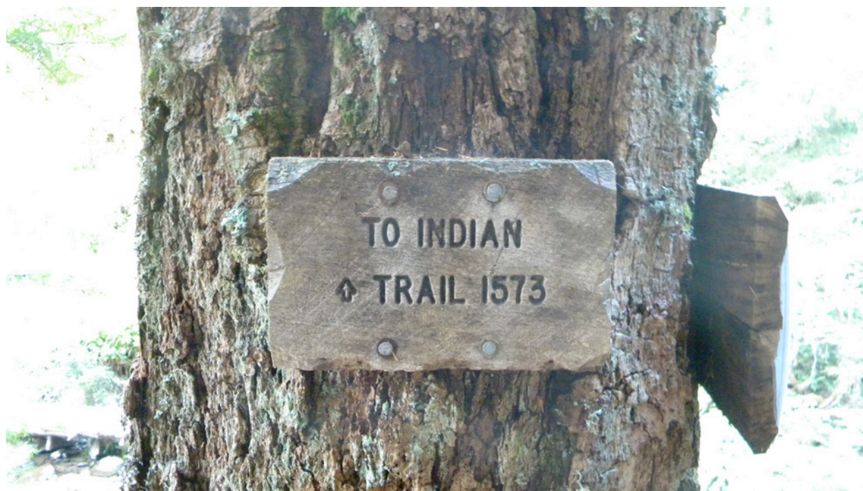
Figure 3.02 Historical USFS trail marker near Fish Lake, July 30, 2010.

The Umpqua National Forest was created on March 4, 1907, from lands two days earlier having been declared the Umpqua Forest Reserve by proclamation of President Theodore Roosevelt. Although the portion of the National Forest in this study had been under federal control as a part of the Cascade Range Forest Reserve -- created September 28, 1893 by proclamation of President Grover Cleveland -- few improvements and no road-building or logging had taken place in the study area during the first 20 years of federal management. People were still dependent on the ancient Indian trail network to travel from one area to the next, along the very riparian and ridgeline foot-trails (now improved sufficiently to accommodate travel by horseback or to drive stock), that had been used for hundreds and thousands of years (see Figure 3.01).